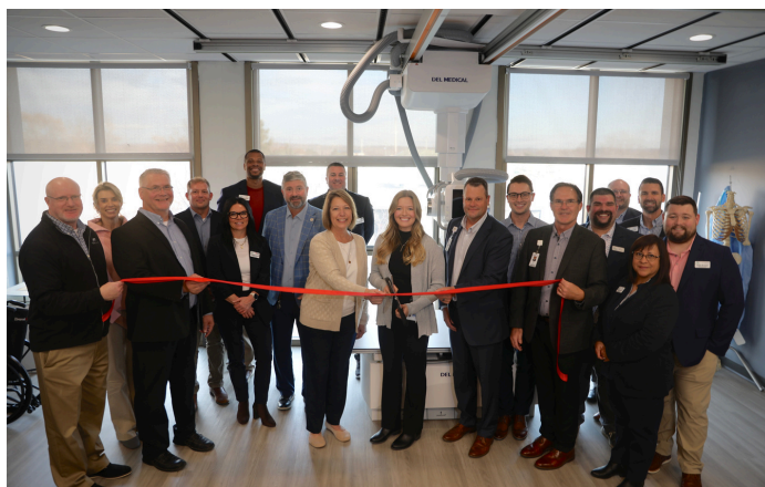
New Radiologic Tech Suite Ribbon Cutting