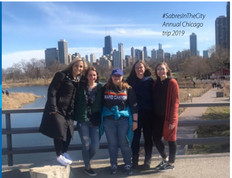
#SabresInTheCity Annual Chicago trip 2019