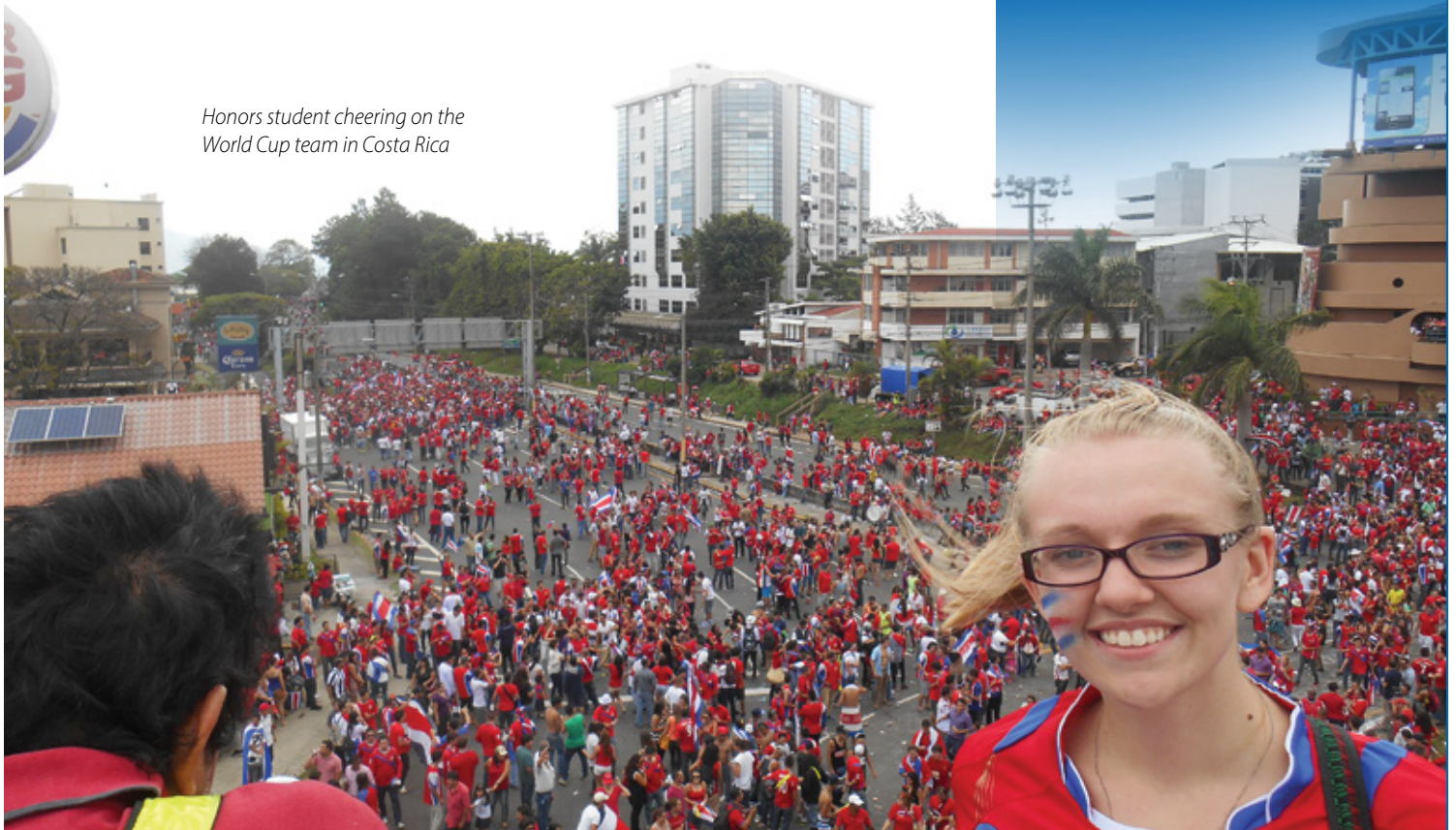
Honors student cheering on the World Cup team in Costa Rica